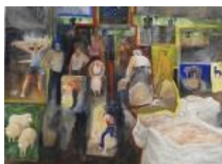
Cut outs, collage and colour craziness to capture the busyiness of shearing time. Penny Maddison.