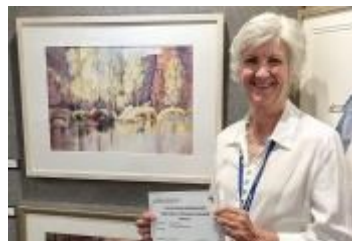
“Morning Light Kalamina” By Annette Wallman Selected by Arts Edge