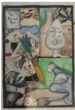
This interesting piece was titled "Mind Altering or Mind of a 15 year old." Artist unknown but I can make an educated guess .