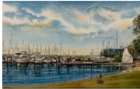
“Matilda Bay Boat Ramp” By Rosalie Tolchard