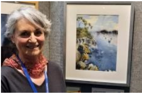
“Throw Away The Brush” By Sue Bass