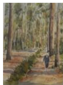
Not sure what happened to the info with this painting—add your own interpretation!

Only a few brave souls attempted this tricky subject. Thank you and well done!