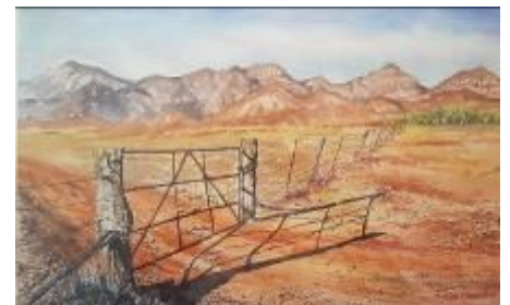
Derrick's winning painting, Station Gate Flinders Range SA