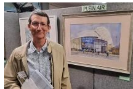
"New Maritime Museum"